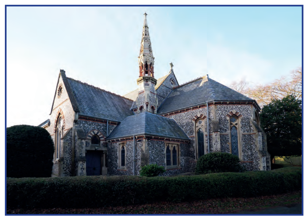
Crist Church, Eaton showing a view of the bell tower.